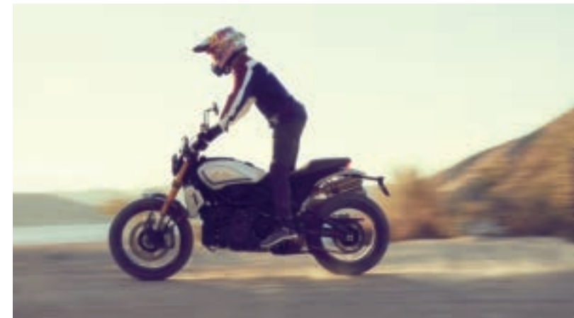
Professional rider. Closed course. Do not attempt.