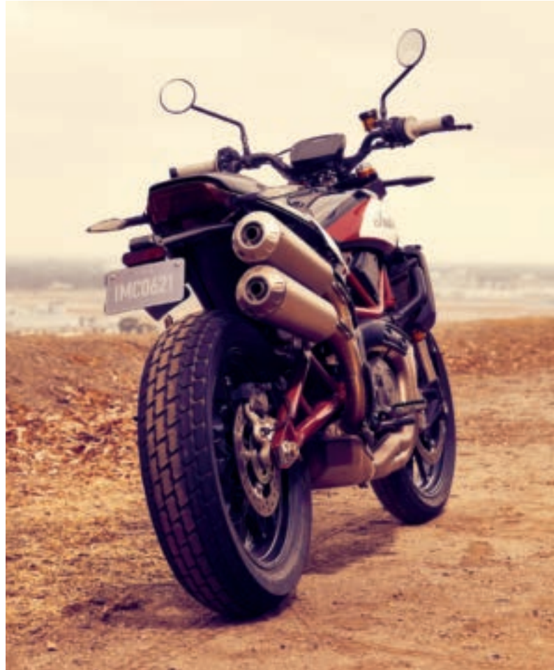
International version of Clear Turn Signals Shown